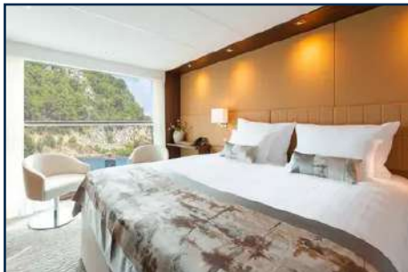
B4 B2 B1 A2 A1

A-1/A-2/B-1/B-2/B4 Cabin (17.5 m 2 / 188.3 sq.ft.) with drop-down panoramic window